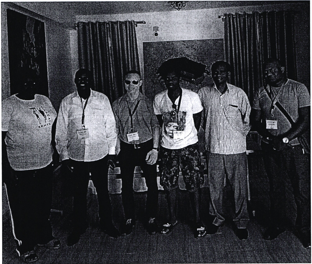
The Delegation poses with the “Misfit” crew, after the screening of their short film at Maru Maru Hotel, Zanzibar.

The main objective of the Zanzibar International Film Festival is to celebrate culture through film while offering a platform for the development of the East African Film Industry. The organizers are driven by the mantra that through film, people from all walks of life come together to celebrate, share ideas while inspiring important dialogues. Film also is also a major contributor to the growth of the economy and to the development of skills and talents in appreciation of culture and arts.