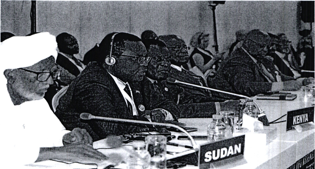
The Rt. Honourable Speaker of the Senate, Sen. Kenneth M. Lusaka, MP together with Amb. Paddy C. Ahenda, the Ambassador of Kenya to the Kingdom of Qatar during a Speaker's Round Table meeting at the 140 th IPU Assembly