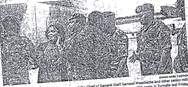
Defence Cabinet Secretary Raychelle Omamo joins Chief of General Staff Samson Mwatethe and other senior military commanders in receiving soldiers who survived the Al-Shabaab attack on a KDF camp in Somalia last Friday. The soldiers were flown to Wilson Airport in a military aircraft yesterday.

President Uhuru Kenyatta yesterday declared that Kenya would not be cowed by terrorists as the Kenya Defence Forces mounted a counter-offensive against Al-Shabaab bases in Somalia. Although the Chief of Defence Forces, Gen Samson Mwatethe, described the counter-attack as "a delicate operation", military planes conducted air strikes against Al-Shabaab, while on the ground, tactical units used armoured vehicles to hit the terrorists' camps in retaliation for the Friday dawn raid against a KDF camp in Eldadde, Somalia. "We shall defend our country by all means and we will unite with other countries in the region to defeat these terrorists," the President warned when he addressed a gathering at Lango Bays Primary School, grounds in Kilifi County. "We shall defend our country and we will unite as a region, fight and defeat them to ensure we live in peace." He asked Kenyans to support the military campaign in Somalia. "We need to give them our full support because it is through their sacrifice and selflessness that we are able to enjoy the current peace and development," he said. "Without the work they are doing (in Somalia) there cannot be development," said the President. And speaking in Nairobi after receiving another group of soldiers who were injured in the Friday